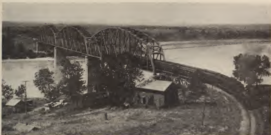
MISSOURI RIVER BRIDGE BETWEEN MANDAN AND BISMARCK

we hope to erect a new chapel to take the place of the old log one.